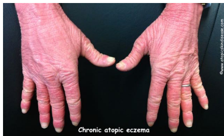
Chronic atopic eczema

When scratching because of itch repeats often enough it becomes a habit - then it can happen without itch, and without awareness . This is a damaging complication of atopic eczema that can prevent usual treatment healing the skin. Habit reversal is needed - together with optimal topical treatment: a combined approach!