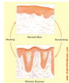
Healing Normal Skin Scratching Chronic Eczema

It is important that prescribed creams and ointments are used correctly at the same time as habit reversal - a COMBINED APPROACH!