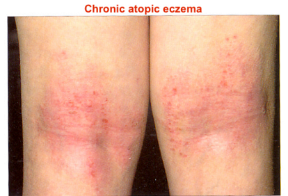
Chronic atopic eczema